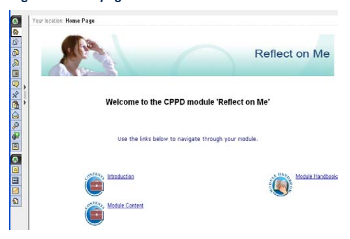
Figure 2: Front page of WebCT module 'Reflect on Me'

The module will be piloted in semester two of this year and has three intended outcomes. The first is to evaluate its 'fitness for purpose' across a varied range of programmes. The second is to evaluate the potential for the skills developed within the module to be transferable to subsequent programme activities. The third is to assess the feasibility for developing a staff version of the module.